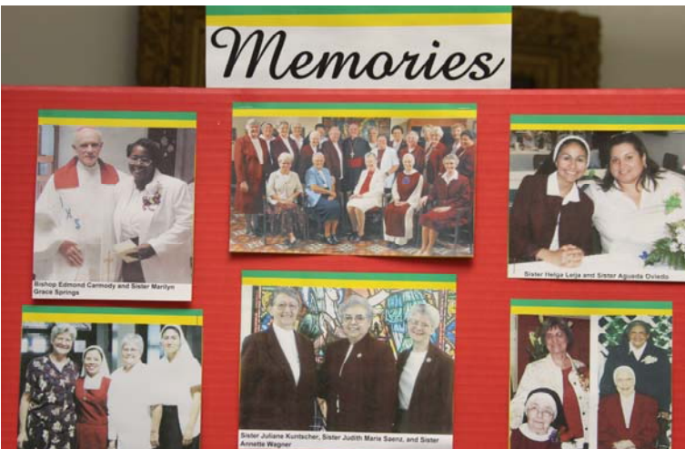
Photos for 140th Anniversary