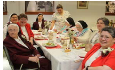
Sisters and guests gather in the dining room for lunch after the Mass for the feastday.